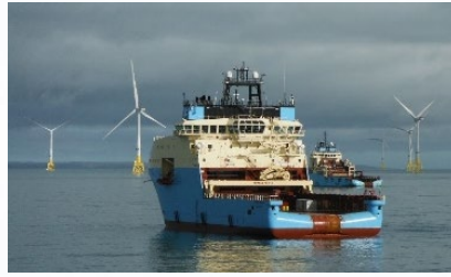
FLOATING TURBINE INSTALLATION