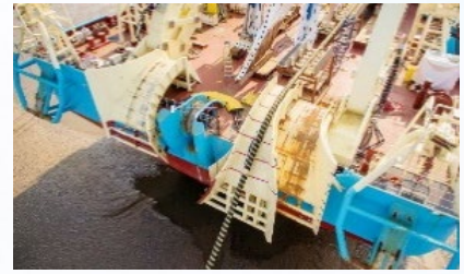
INTER-ARRAY CABLE EXCHANGE