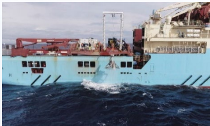
CABLE, MONOPILE, AND SEABED SURVEY