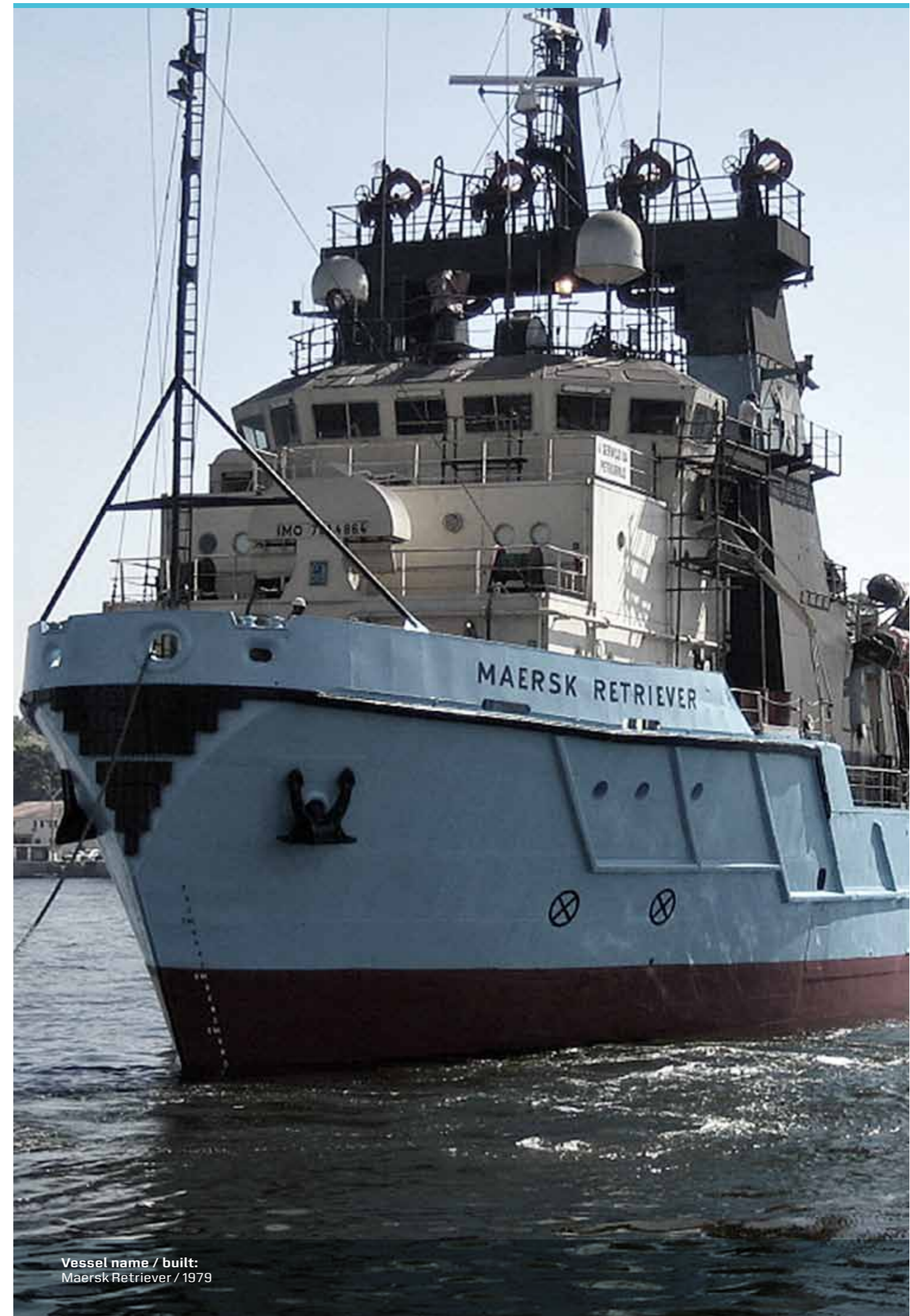
Vessel name / built: Maersk Retriever / 1979